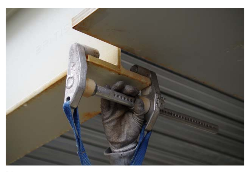
Photo 2: First accident: Beam glider at open end of beam (37mm wide gap) [Reconstruction]