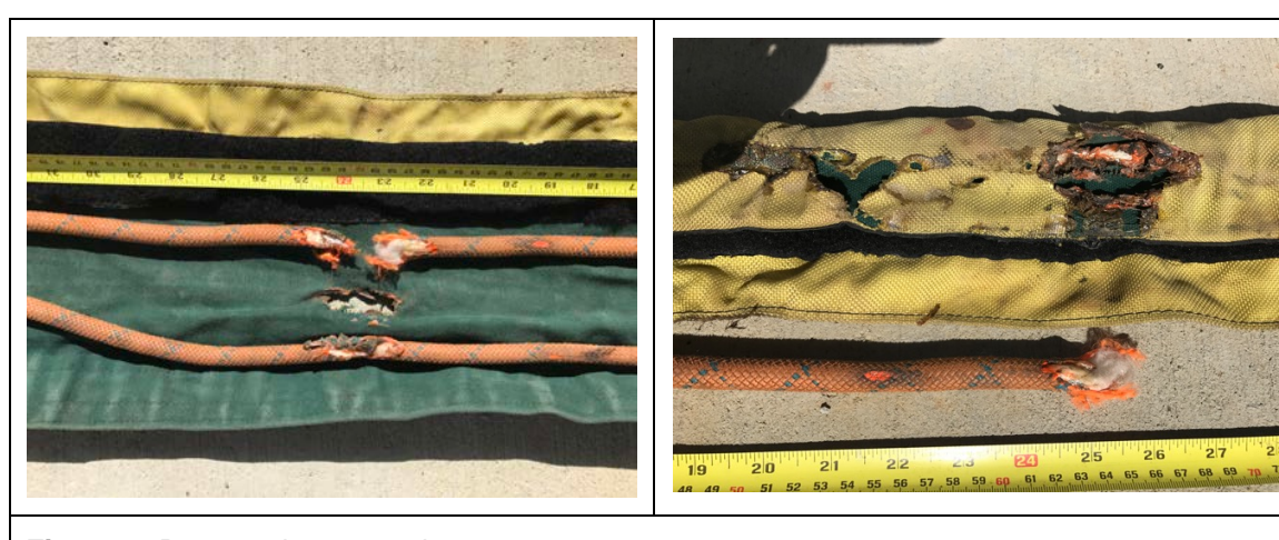
Figure 2: Damaged ropes and rope protector